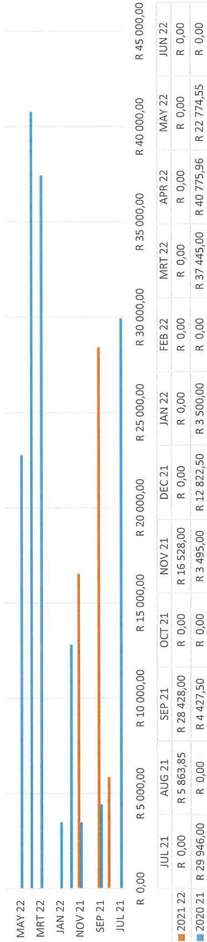
(SCM Regulations 16 (c)) & 17 (c)