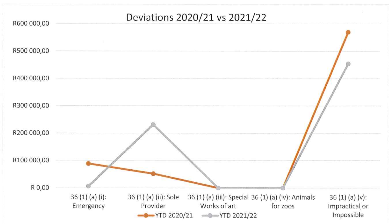
Table 9.: Breakdown of deviations – year to date